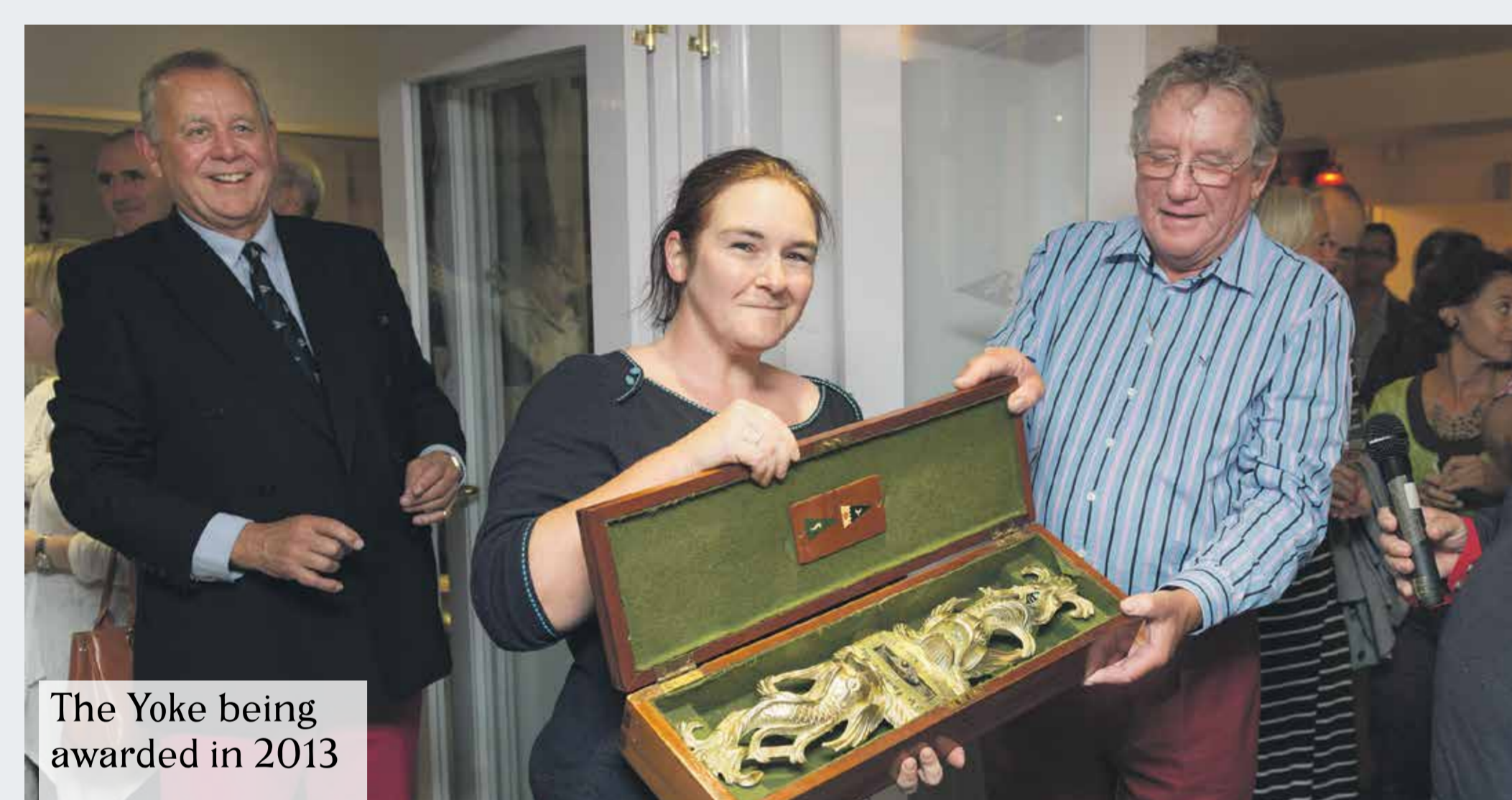
The Yoke being awarded in 2013