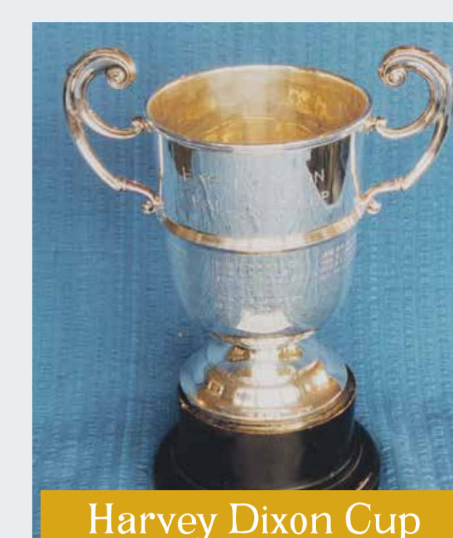
Harvey Dixon Cup