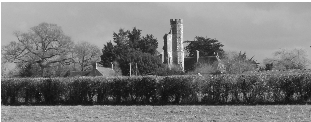
The gatehouse is all that remains of Margaret Pole's Warblington Castle

The park, fishponds, orchards and gardens provided additional food and herbs for the table, as well as for medicinal purposes, while the adjacent deer park of 184 acres provided opportunities for hunting and hawking.