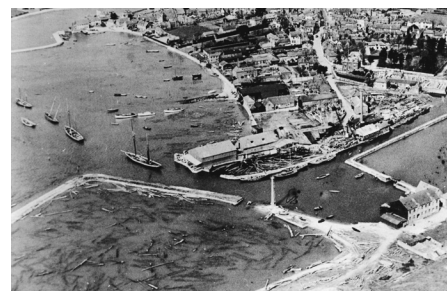
Aerial views showing the logging pond c 1930 (left) and the marina as it is today

Emsworth Marina has won a number of awards in recent years. It received The Yacht Harbour Association Marina of the Year accolade as Runner up in 2020, 2024 and Winner in 2021, 2022, 2023.