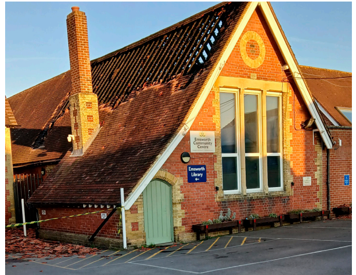
Fire damage to the Assembly Room roof

The evening ended with the monthly draw of the 50/50 club prizewinners followed by wine, nibbles and chat in the David Rudkin Room. Nigel Craig was the lucky winner of both prizes.